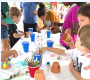
Painting pots for planting at Murray Farmer's Market

It's a great week to support your local farmers and shop and eat at your locally owned businesses.